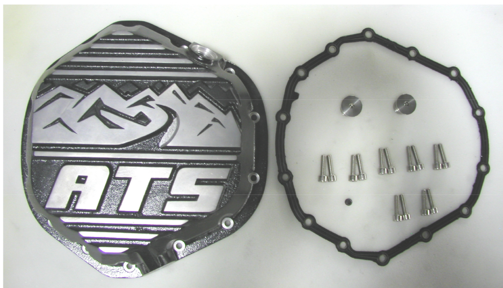
Figure 1: GM/Dodge ATS Protector Differential Cover Kit

For some installations, removing the spare tire may provide better access to the work area. It is not necessary in every case. The installer should determine if there is adequate workspace prior to starting the installation.